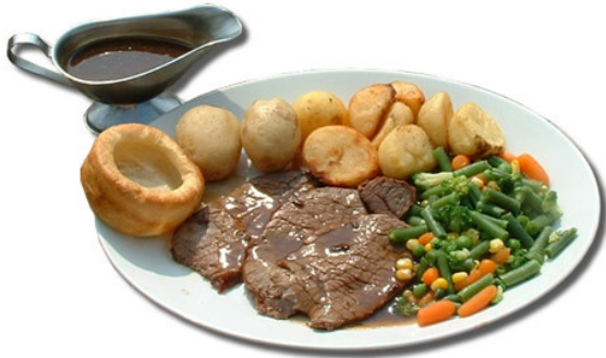
Sunday Roast (consisting of a roasted meat, vegetables, roasted potatoes, Yorkshire pudding and gravy sauce)